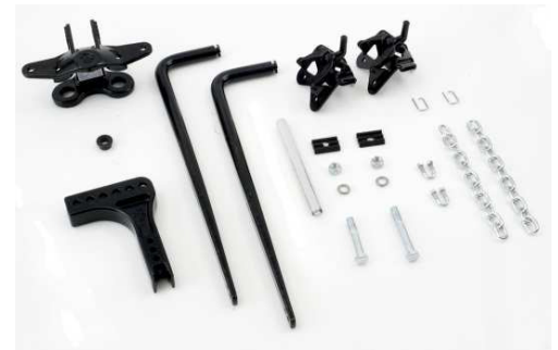
Common parts included in both parts

Common features for 600lb and 800lb kits