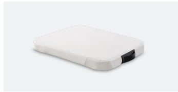
DOMETIC CI-SC55 Seat cushion for CI 55