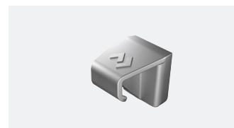
DOMETIC CI-BOP Bottle opener for CI iceboxes