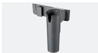
DOMETIC CI-RDH Rod holder for CI iceboxes