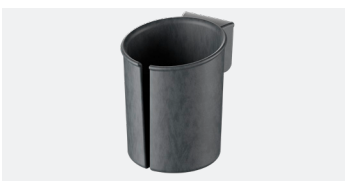
DOMETIC CI-DRH Drink holder for CI iceboxes