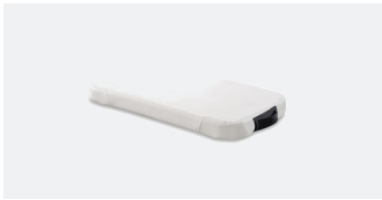
DOMETIC CI-SC42 Seat cushion for CI 42