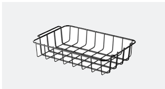
DOMETIC CI-BSKS Small basket for CI iceboxes