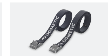
DOMETIC CI-FK Fixing kit for CI iceboxes