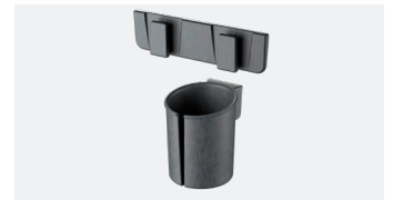
DOMETIC CI-DRHBRK Bracket for CI iceboxes