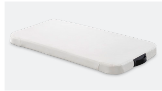
DOMETIC CI-SC70 Seat cushion for CI 70