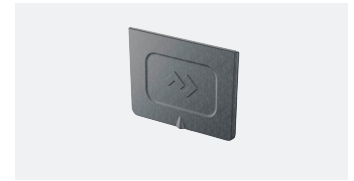
DOMETIC CI-DIVS Small divider for CI iceboxes