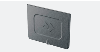
DOMETIC CI-DIVL Large divider for CI iceboxes