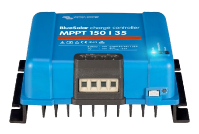
Solar Charge Controller MPPT 150/35