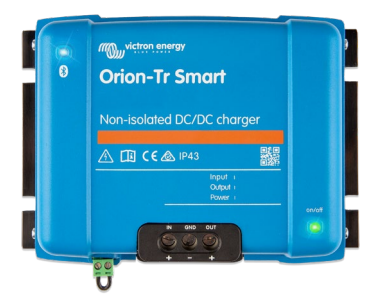
Orion-Tr Smart non-isolated 12/12-30