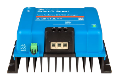
Orion-Tr Smart non-isolated 12/12-30