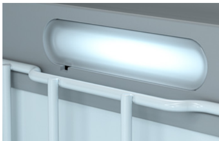
LED LIGHT Energy efficient LED interior light