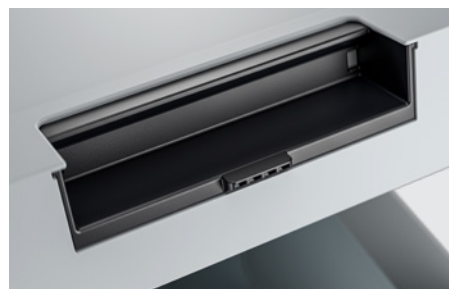
EASY OPENING HATCH Quick access to the interior