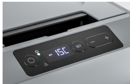
DIGITAL TEMPERATURE DISPLAY Digital display for quick overview on temperature settings