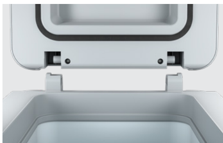
REMOVABLE LID AND STURDY HINGES Easy removal of the lid for convenient cleaning of the interior