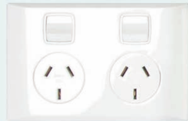
Quality Double Pole Dual outlet GPO with AC Plug & Play Connector

Custom layouts can be arranged subject to applications.