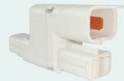
Optional: 1 in 2 out splitter