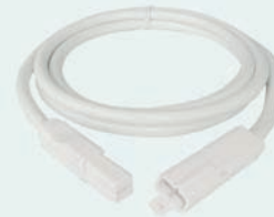
Optional: Link cable in various lengths