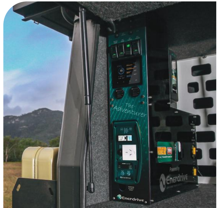
*Passenger side, Simarine with x2 USB Outlets pictured