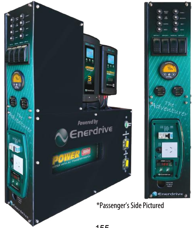
*Passenger's Side Pictured