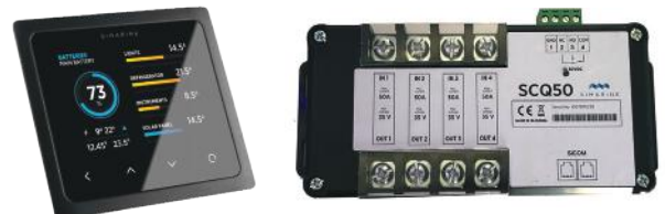
*Optional Simarine Pico Monitor and SCQ50 Shunt