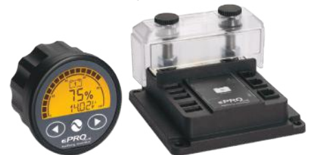
*Standard ePRO Plus Battery Monitor