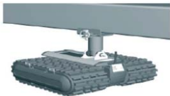
Illustration of the Camper Trolley mounted on the side members of the caravan: