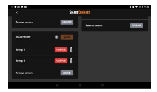
Figure 26: Unpairing the SmartTemp temperature sensor

6. To unpair the SmartTemp sensor, press the "Unpair" button below the SmartPressure tile, and then press the red "Unpair" button to complete the process of unpairing the sensor.