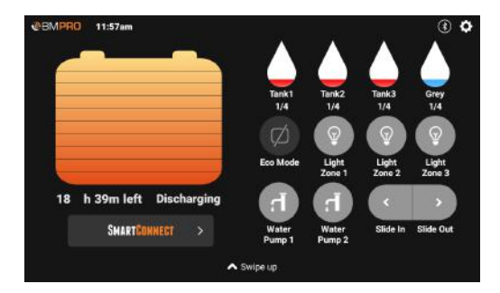
Figure 7: The OdysseyApp Home screen

1. To access the sensors page, press the "SENSOR" button at the top right corner of the OdysseyControl App home screen.