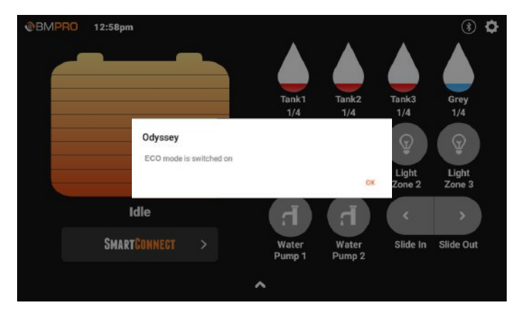
Figure 28: ECO Mode is switched on

This pop-up message will occur if the battery button on the OdysseyControl has been selected. The battery icon will be light grey. Press the battery button again to power and regain control of loads.