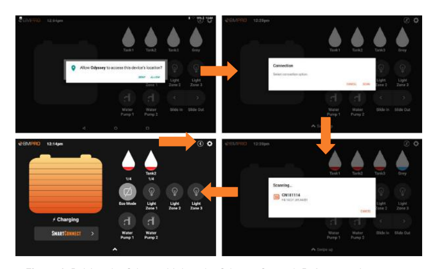
Figure 4: Pairing the OdysseyLink to the OdysseyControl. Before starting a scan, the Odyssey App may request access to the device's location-always allow.

If successful, the Pairing Status icon on the Odyssey App will show that the OdysseyControl and OdysseyLink are connected.