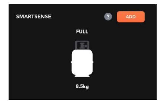
Figure 11: SmartSense propane sensor icon after successful pairing

6. If pairing was successful, the screen will indicate the tank level