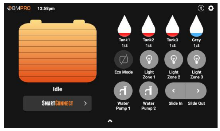
Figure 6: Customize the view to choose the features displayed on the OdysseyControl