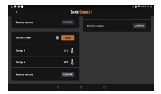
Figure 20: Adding a SmartTemp Temperature Sensor

To pair the temperature sensor, press the "ADD" button.