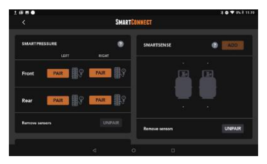
Figure 8: Adding gas sensor

2. A new page will appear with a "ADD" button. By pressing the "Add" button, this will direct you to a new page where "Pair" and "Unpair" buttons are displayed.