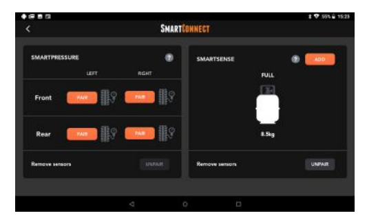
Figure 15: SmartPressure sensor pairing screen

1. To pair the pressure sensor, press the "Pair" button at the location where you want to install the pressure sensor.