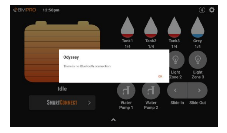
Figure 30: There is no Bluetooth connection.