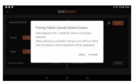
Figure 18: Pairing failed message

4. If pairing was unsuccessful, a notification message will appear "Pairing Failed: Cannot Detect Sensor" along with "Try again" and "Cancel" buttons.