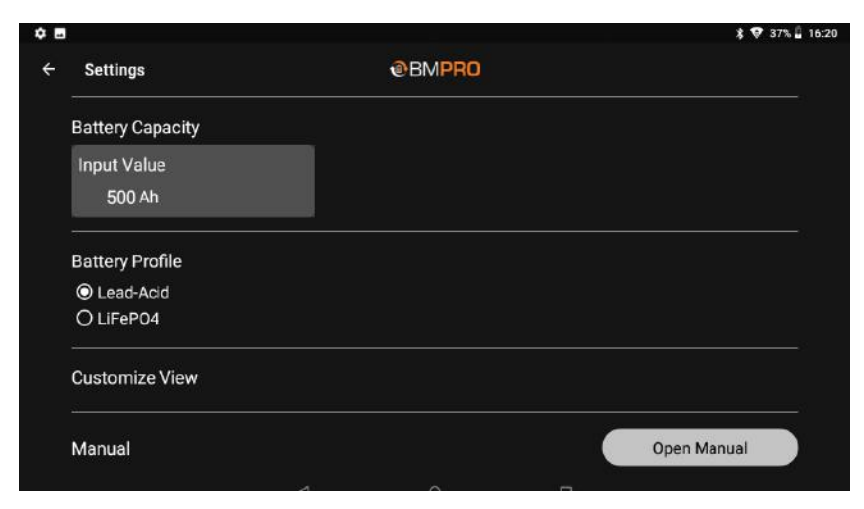
Figure 5: Configuring a new battery. The option to configure Battery Profile is not available if your Battery Plus 35 is incompatible with lithium charging.