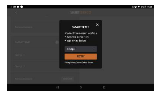
Figure 25: Pairing failure

5. If Pairing was unsuccessful, a message will appear "Pairing Failed: Cannot Detect Sensor"