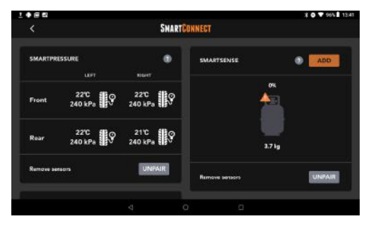
Figure 17: SmartPressure sensors icons after successful pairing

3. If pairing is successful, the tire icon will be changed to the white color instead of grey and the pressure of the tire will be displayed