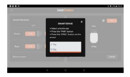
Figure 9: Selecting bottle size