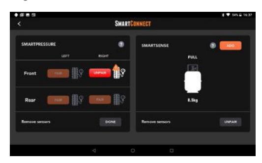
Figure 19: Unpairing the SmartPressure Tire sensor

5. To unpair the SmartPressure sensor, press the "Unpair" button below the SmartPressure tile, and then press the red "Unpair" button to complete the process of unpairing the sensor.