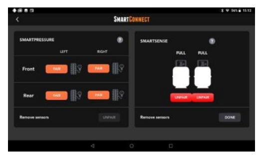
Figure 14: Unpairing SmartSense Propane sensor

8. To unpair, press the red "UNPAIR" button under the corresponding tank