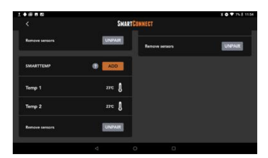
Figure 24: SmartTemp sensor after successful pairing

4. After pairing is successful, temperatures sensors will be listed, and temperatures will be indicated