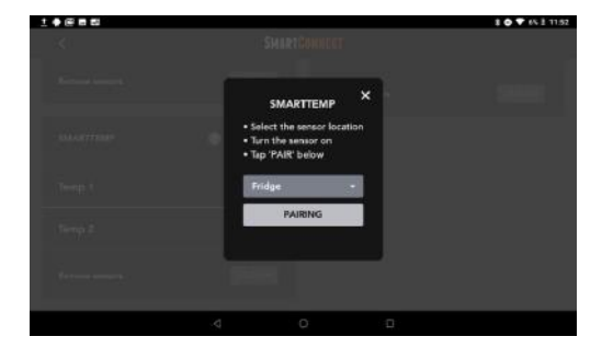
Figure 23: Pairing in Progress

3. Press the pair button to start pairing the temperature sensor.