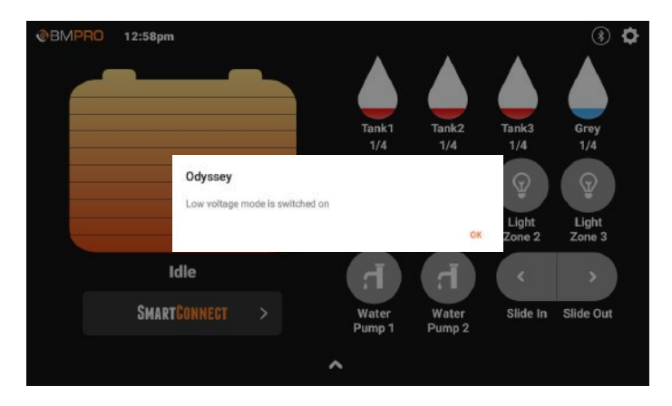
Figure 29: Low voltage mode is switched on