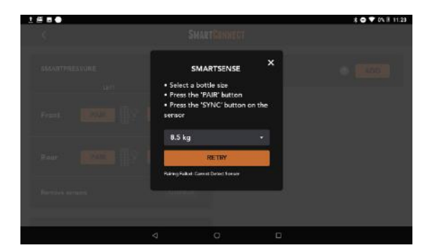
Figure 13: Pairing failure

7. If pairing unsuccessful, a message will appear "Pairing Failed: Cannot Detect Sensor"