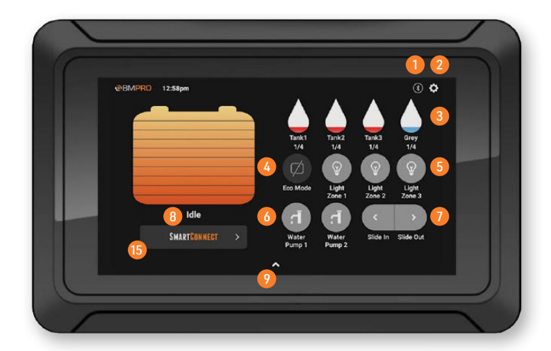
Figure 1: The OdysseyControl Dashboard