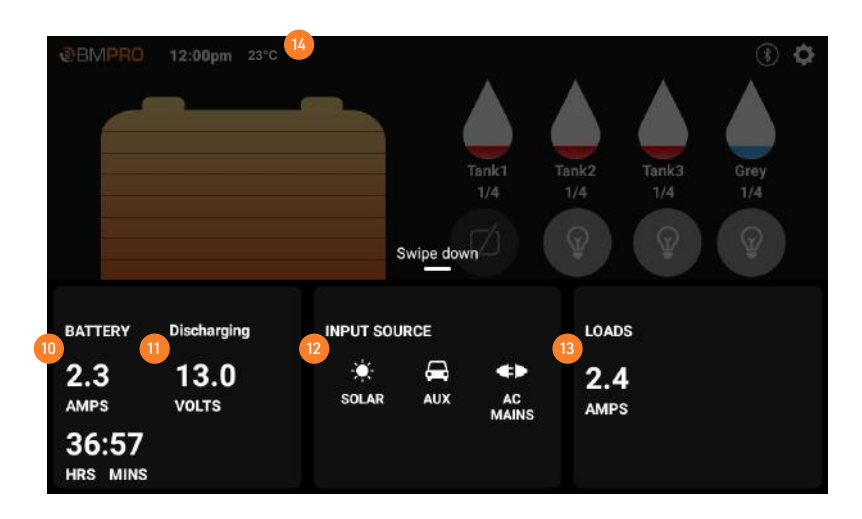
Figure 2: OdysseyControl Battery and Power Consumption