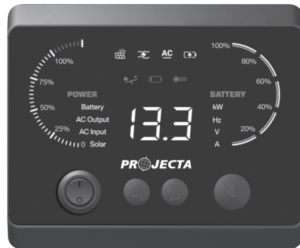
LBM-BT Lithium Battery Monitor