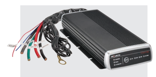
Pre-wired cabling, labelled for ease of installation

The IDC45 provides the ultimate solution for the most demanding DC/Solar battery charging applications.