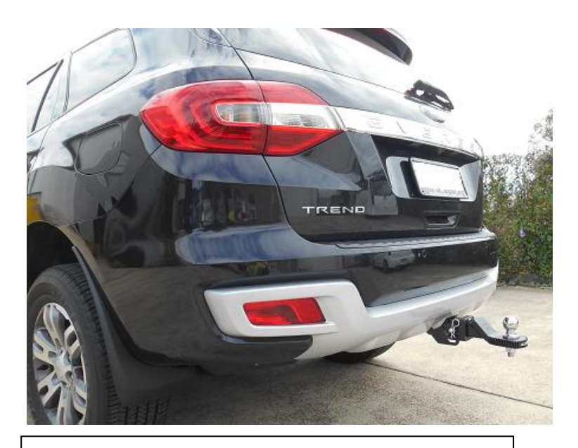
Fit with wiring harness part No. xxxx