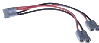
50 AMP SINGLE ANDERSON STYLE PLUG TO TWIN ANDERSON STYLE PLUGS PART NO. TDR02004