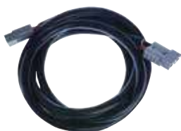
50 AMP ANDERSON STYLE PLUGS 3M EXTENSION LEAD PART NO. TDR02003