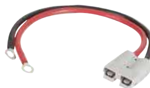
50 AMP ANDERSON STYLE PLUG TO EYE TERMINALS LEAD PART NO. TDR02005