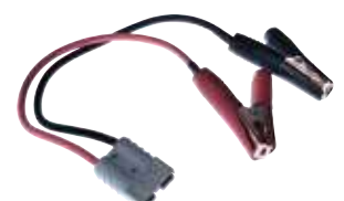
50 AMP ANDERSON STYLE PLUG TO ALLIGATOR CLIPS LEAD PART NO. TDR02006