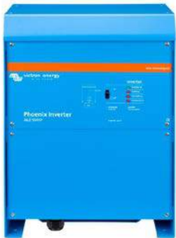
Phoenix Inverter 24/3000