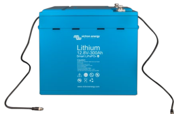
12,8V 300Ah LiFePO 4 Battery

Very useful to localize a (potential) problem, such as cell imbalance.