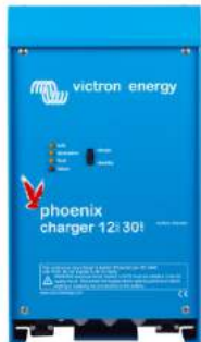
Phoenix Charger 12 V 30 A