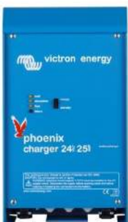
Phoenix Charger 24 V 25 A